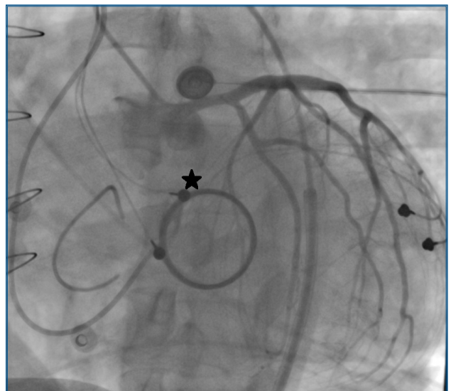
Figure 1. Fluoroscopic LAO 28° image obtained during the procedure depicting epicardial right and left ventricular pacing leads and a mechanical mitral valve. Also depicted is left coronary angiography. The approximate site of ablation is tagged by an asterisk (*). LAO: Left anterior oblique.