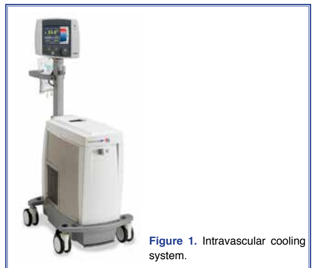
Figure 1. Intravascular cooling system.