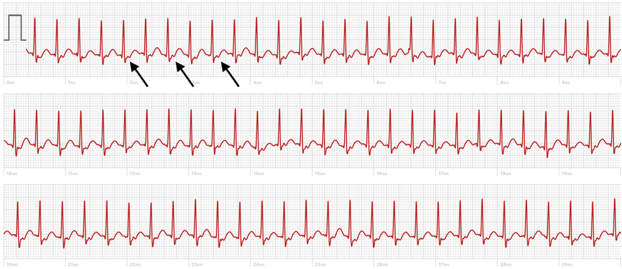
25 mm/sn, 10 mm/mV, Derivasyon I, 512 Hz, iOS 14.2, watchOS 7.1, Watch6,1 – Bu dalga formu Derivasyon I EKG'ye benzerdir. Daha fazla bilgi için Kullanma Yönergeleri'ne bakın.