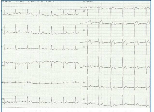
Figure 2. ECG during admission showing biphasic T wave inversion in the lead V1-4. ECG: electrocardiography.