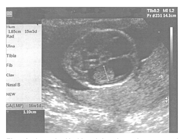
Figure 2: The atrial width of the right lateral ventricle was measured 11 mm at the 16th week of gestation.

was measured 11 mm by fetal sonography at the 16th week of gestation (Figure 2). There were no any cerebral or extracerebral structural abnormalities. The fetal karyotype and maternal serology for the TORCH group of infections were normal. The couple was informed that the majority of babies with such a mild ventriculomegaly have a completely normal outcome if there are no other associated anomalies and a normal karyotype exists. However, the couple opted for termination of the pregnancy.