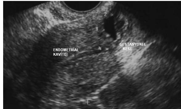
Figure 2: TVUSG image (cervical internal os closed, the gestational sac was invaded the front wall of the cervix and the endometrial cavity was empty).

Methotrexate 50 mg/m 2 was applied the patient who had normal laboratory values. In the follow up the \beta -hCG value regressed and no complication was detected.