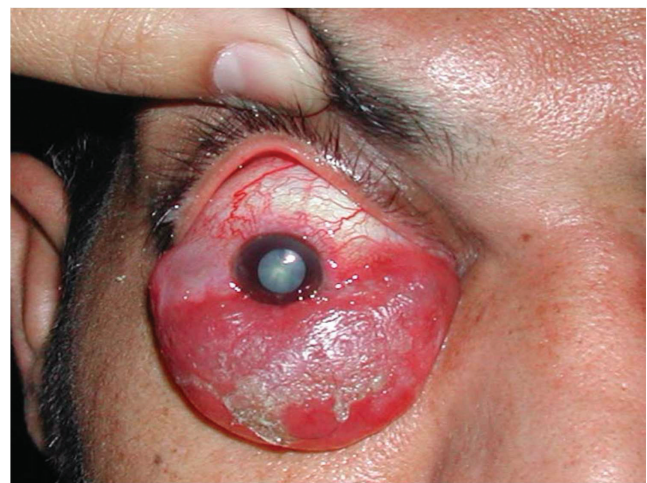
Figure 1. Posttraumatic right carotid-cavernous fistula with proptosis, chemosis, conjunctival prolapse, and cataract