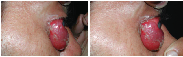
Figure 2. Positive Valsalva test