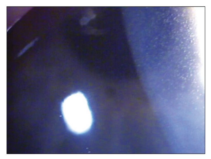
Figure 1: Photograph depicting multiple corneal epithelial microcysts.