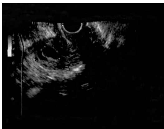
Figure 2. Ultrasonography demonstrated lobulated uterine enlargement, with focal anechoic area.

CD45RO (UCHL-1, a T-cell marker) and CD7 immunostainings were negative. But there were many reactive T-cell with staining CD7 and CD45RO (+) in stroma. Eighty percent (80%) of the tumor cells showed intensive positivity to Ki-67 nuclear proliferative antigen. Pathologic examination revealed the final diagnosis of a primary, diffuse, large B-cell NHL of the uterus according to the WHO Classification. A complete clinical staging workup including CT scan of the abdomen and thorax, MRI of abdomen, abdominal ultrasonography, bone marrow biopsy and aspiration, and blood tests were carried out. Ultrasonography demonstrated lobulated uterine enlargement, with focal anechoic area (Figure 2). An MRI examination was showed full