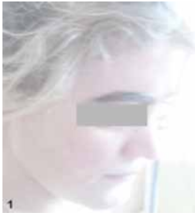
Figure 1. Decreased pigmentation in hair and skin.