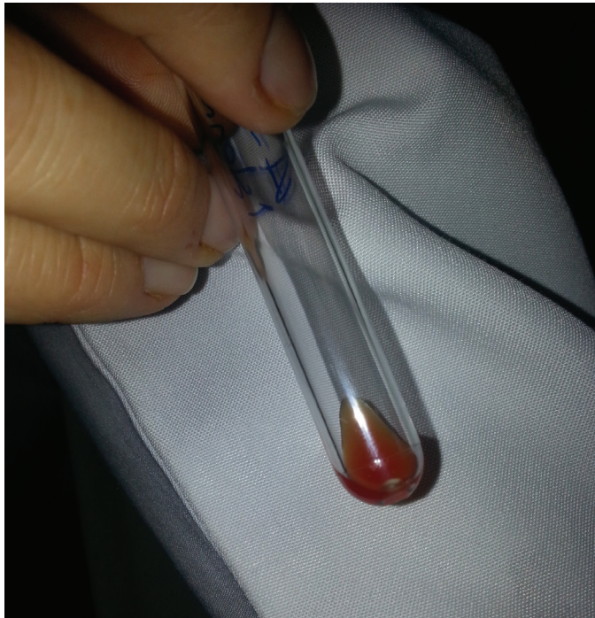
Figure 3. Group A and group B erythrocytes in the same tube incubated with incomplete anti-A and -B fragment antibody fragments and after addition of complete anti-A and -B to the medium. No agglutination.

Although complete anti-A and -B antibodies cause strong agglutination, the Fab (2) parts of these antibodies caused