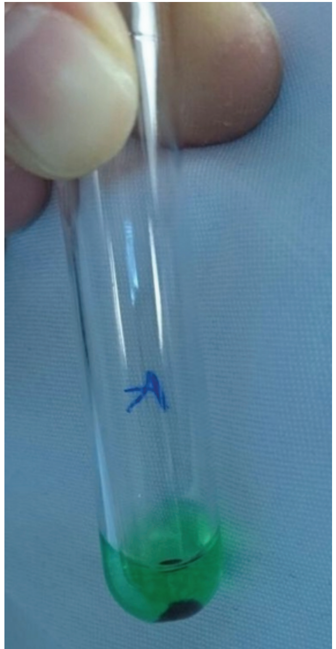
Figure 4. Group A and group B erythrocytes in the same tube incubated with complete anti-A and -B antibodies. Positive agglutination.

minimal or no agglutination in the card and tube cross-match tests. Minimal agglutination with Fab (2) parts was similar to the negative controls. These results come from the characteristic features of an antibody. The Fab part of an antibody binds to the antigen, and the Fc part of the antibody both starts agglutination and stimulates the immune system via activating the complement system and/or binding to Fc receptors of macrophages or lymphocytes [10,11,12]. Fc and its interactions with the Fc receptors of macrophages have a critical role and are required for antibody response [16,17]. Hemolytic disease of newborns is a good example of this pathologic mechanism of antibody response.