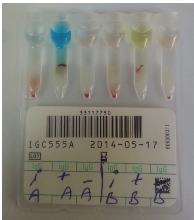
Figure 1. A) Group A erythrocytes: Ai, with incomplete anti-A antibody (1+ reaction); A+, with complete anti-A antibody (4+ reaction); A-, with negative control (no reaction). B) Group B erythrocytes: Bi, with incomplete anti-B antibody (1+ reaction); B+, with complete anti-B antibody (4+ reaction); B-, with negative control (no reaction).

For the card test, we observed a 1+ reaction for the purified incomplete anti-A Fab (2) and A Rh+ erythrocyte combination. However, we observed 4+ reactions for the complete anti-A antibody with the A Rh+ erythrocyte combination. No positive reactions were observed in the negative control wells. The test results were similar for the B Rh+ erythrocyte and complete anti-B or incomplete anti-B Fab (2) antibody combinations and negative controls (Figures 1 and 2).