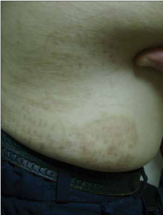
Figure 1. Signs of incisions and suction marks on the skin