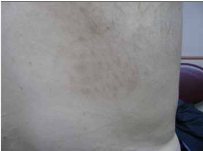
Figure 3. Signs of incisions on the skin