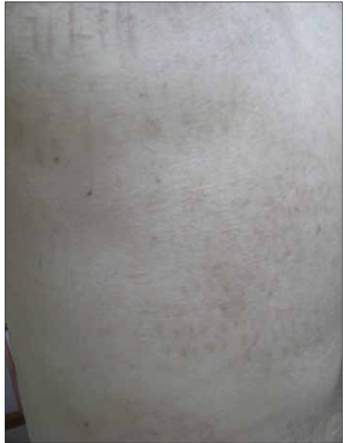
Figure 2. Signs of incisions on the skin