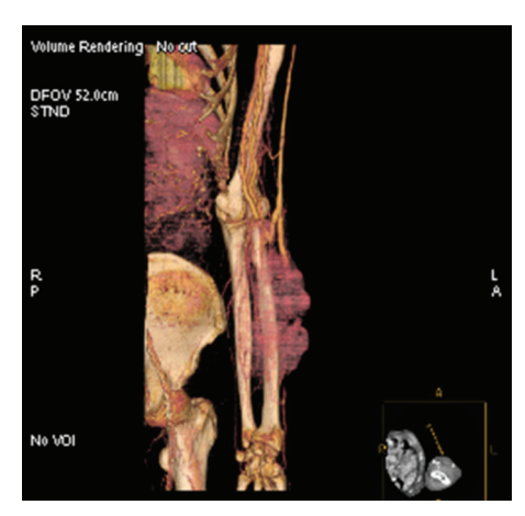
Figure 2. Multislice computer tomography angiography of the arteriovenous fistula.

A 78-year-old male was hospitalized in October 2013 due to renal failure. Soon thereafter, light-chain deposition disease was confirmed (lambda type DSSS IIIA, ISS III). A high-dose DEXA protocol was introduced and he received 11 protocols during the following 12 months. In October 2014 he commenced maintenance hemodialysis (HD) via a distal arteriovenous fistula (AVF). In March 2015 he noticed swelling of the fistula region. Although the AVF was functional, local findings on the skin deteriorated within 1 month (Figure 1). Multislice computer tomography demonstrated highly vascularized tumor-like changes originating from the AVF (Figure 2). The patient underwent aspiration biopsy of the skin and more than 10% lymphoplasmacytic cells were found by microscopy. The finding