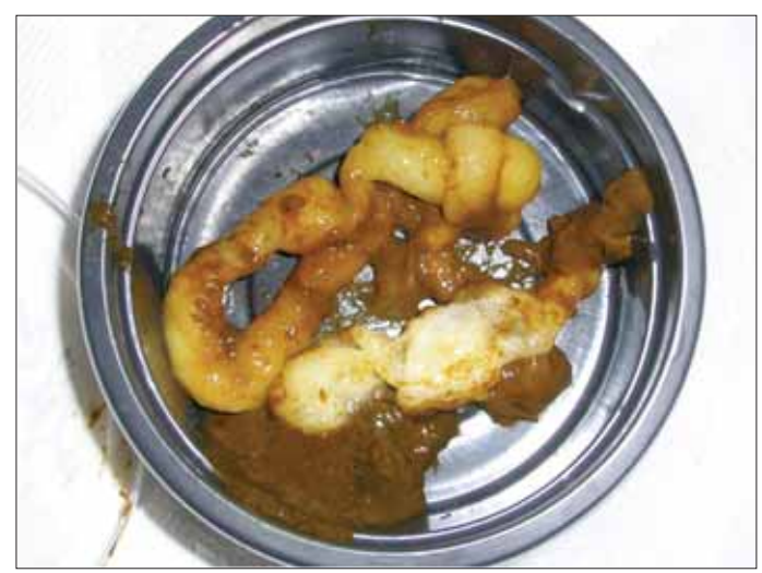
Figure 1. Macroscopic view of mucus accumulation

She was treated with wide-spectrum antibiotics and antifungal combination therapy that included imipenem, amikacin, metronidazole, liposomal amphotericin-B, and caspofungin. She was also given granulocyte colony-stimulating