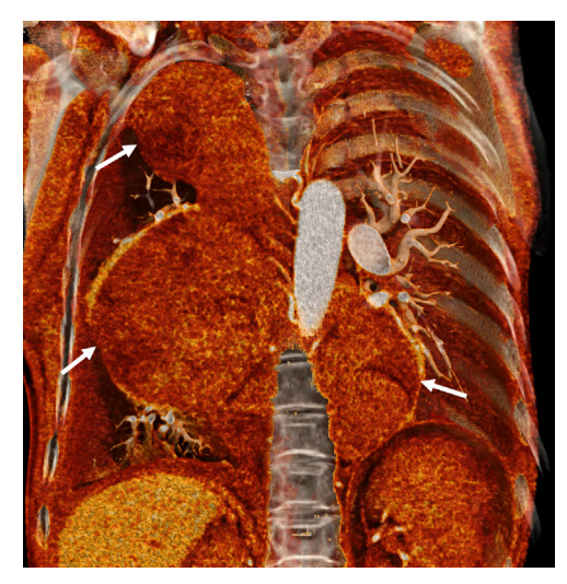
Figure 2. Three-dimensional volume rendering image of the chest demonstrates huge paravertebral masses (arrows). Note the H-shaped vertebral bodies (central endplate depression) due to sickle cell disease.

Figure 1. (A, B) Axial contrast-enhanced chest computed tomography images show well-defined giant masses in the mediastinum with areas of macroscopic fat densities (filled arrows). Note the tracheal compression and narrowing due to the right paravertebral mass (hollow arrow).