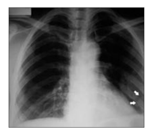
Figure 1. Chest X-ray showing a homogenous radioopacity on the left hemithorax.

The clinical impression was a neurogenic tumor preoperatively. The patient underwent a video-assisted thoracoscopic surgical procedure (VATS). There was a laterally localized, multilobar, reddish mass on the sixth rib. The surface of the diaphragm was intact. The mass was excised totally from the chest wall. Frozen section was reported as a sple-