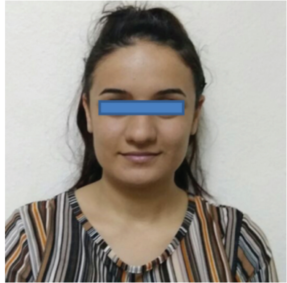
Figure 2. A photograph of case 1 showing cyanosis of her lips. cities. However, these patients had low transcutaneous oxygen saturations, as shown in parentheses in Figure 1a. Hemoglobin Kansas and other unstable hemoglobinopathies with low oxygen affinity should be considered in the differential diagnosis of patients with unexplained peripheral cyanosis.

In total, six hemoglobin Kansas cases were reported from 1968 to date in the world literature [2,3,4,5]. The first hemoglobin Kansas case in Turkey was reported in 2015 [1]. Our patients and 17 other family members who had the same phenotype are more than all of the reported cases in the world literature. We could not perform hemoglobin electrophoresis and genetic evaluations of the other 17 family members because they were living in other