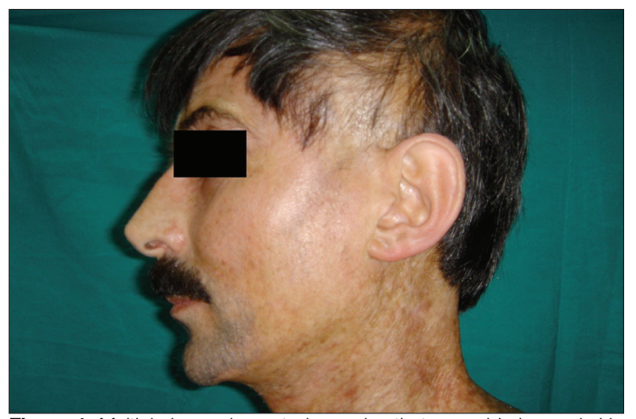
Figure 1. Multiple hyperpigmented macules that resemble leopard skin on the neck and cicatricial alopecia on the left temporal region

The development of sclerodermatous GVHD was observed in 22 (5.2%) out of 423 patients. Thirteen patients were male and 9 were female, with a mean age of 32\pm9 years. All the patients were transplanted from HLA-identical sibling donor. Sex mismatch was found to be statistically significant in the development of sclerodermatous GVHD (p=0.02). CsA plus short-term methotrexate (n=18) or MMF (n=4) was used for prophylaxis of GVHD (Table 1). History of aGVHD (> Grade II) was present in 17 patients (77%), with hepatic involvement in 2, gastrointestinal tract involvement in 2 and skin involvement in 13 patients. Eight patients (36.4%) progressed from lichenoid to sclerodermatous lesions, 2 (9.1%) with lichenoid and