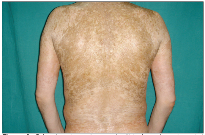
Figure 2. Sclerodermatous changes (multiple hyper-hypopigmented macules) of cGVHD presented with trunk involvement unlike acral involvement of scleroderma

Moderate (7 patients) or severe (5 patients) cGVHD developed in 12 patients, while it was mild in 10 patients. Five patients (23%) developed de novo chronic cutaneous GVHD without a previous aGVHD. Sclerotic lesions developed after a mean of 752±647 days (median 480). Immunosuppressive therapy was interrupted in 16 (72%) patients before sclerodermatous lesions had developed. Sclerosis was generalized in 19 patients (86.4%) and localized in 3 patients (13.6%). There was no statistically significant difference between the extensiveness of sclerodermatous GVHD and presence of previous aGVHD (p=1.00) or cGVHD (p=0.21). Widespread, welldemarcated, hyperpigmented macules and hypo-hyperpigmentation appeared in 8 (36.4%) and 11 (50%) patients, respectively (Figure 1). In most of the patients, sclerotic lesions