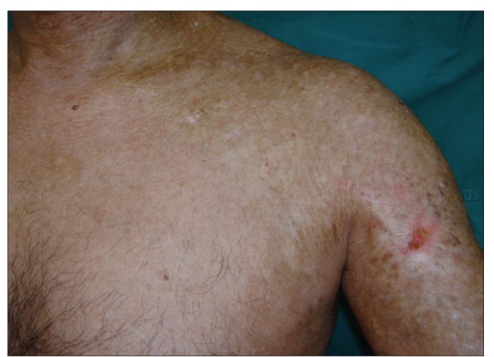
Figure 5. Sclerodermatous poikilodermatous changes of cGVHD with ulceration on the upper arm

appeared on the trunk, and distal parts of the extremities were spared (Figure 2). Joint retractions and dysphagia developed in 2 (9%) patients (Figure 3). None of the patients had Raynaud phenomenon. Autoimmune markers like SCL-70, ACA, ANA, and anti-DsDNA were negative in all patients.