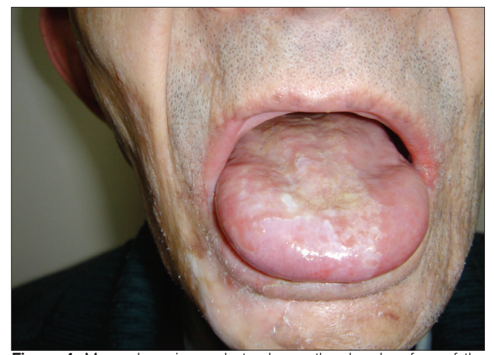
Figure 4. Mucosal erosion and atrophy on the dorsal surface of the tongue