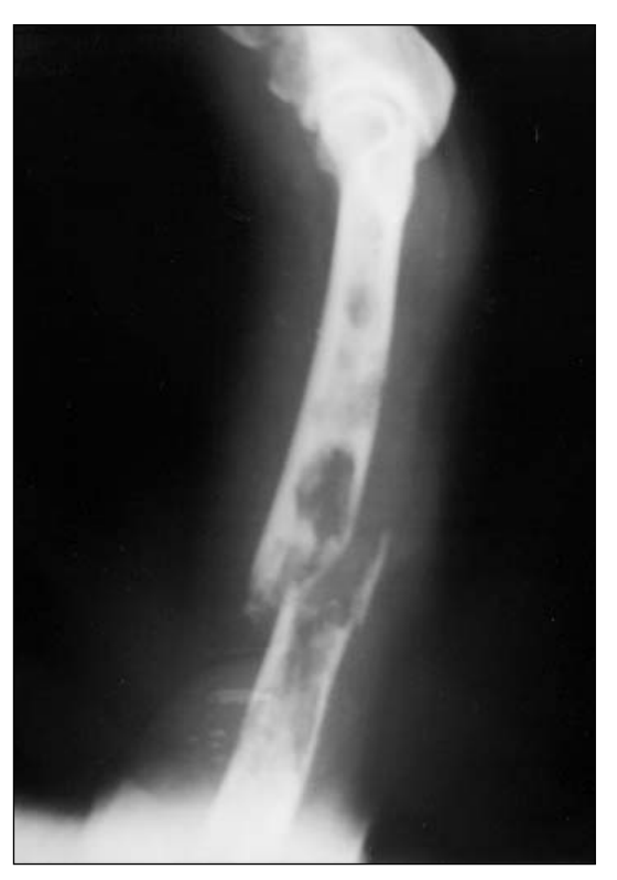
Figure 1. X-ray of humerus showing multiple lytic lesions and fracture line.

The case was evaluated as stage I (Rai staging system) CLL and had been rehydrated than received intravenous infusion of pamidronate (90 mg), cyclophoshamide (C) (500 mg for 5 day), vincristine (V) (2 mg on day 1), prednisone (P) (80 mg for 5 day) (CVP). Curetage, open reduction and fixation had been performed and remaining cavities were filled with bone cement. Three cycles of CVP were applied. During the followup the hypercalcemia has been reversed but the patient died because of systemic infection.