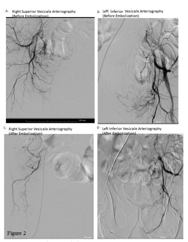
Figure 2. Pre- and post-embolization images.

pressure (BP) decreased to levels as low as 80/50 mmHg. On the 15<sup>th</sup> day of hospitalization transcatheter embolization was planned. The images obtained during embolization revealed hypervascular lesions that were fed by the inferior vesical artery on the left and the superior vesical artery on the right side. These arteries were embolized with 400-micron microsphere particles. Follow-up angiograms showed that the hypervascular lesions had disappeared (Figure 2).