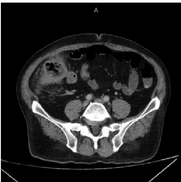
Figure 1-2. Abdominal CT scan image that shows thickened cecal wall, pericecal fluid, and heterogeneity.

computed tomography (CT) of the abdomen were performed. Abdominal CT scan demonstrated thickened cecal wall with pericecal fluid (Figure 1,2).