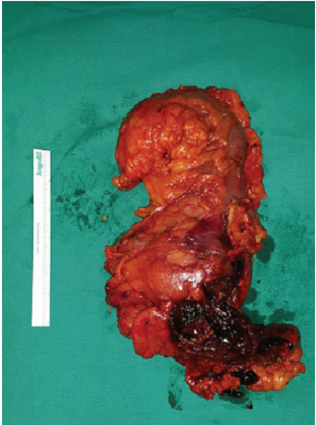
Figure 3-4. Right hemicolectomy specimen shows cecal necrosis with 5 cm perforated area.

the patient was hospitalized for an emergent operation. Under general anesthesia with endotracheal intubation explorative laparotomy was performed. It was seen that cecal wall was perforated in the area of ischemia and partially closed by an anterior abdominal wall (Figure 3,4).