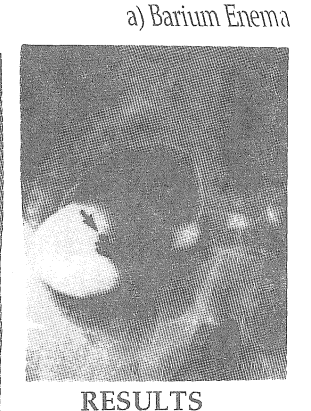
Fig. 4. AG -A1