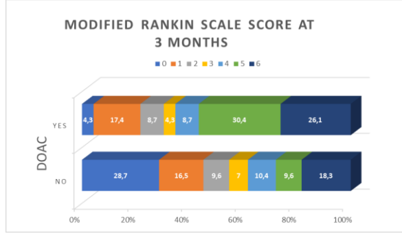
Figure 2. Distribution of modified Rankin Scale (mRS) scores at 90 days.

NIHSS: National Institutes of Health Stroke Scale, TICI: Thrombolysis in Cerebral Infarction, ASPECT: The Alberta stroke program early CT score, DOAC: direct oral anticoagulants