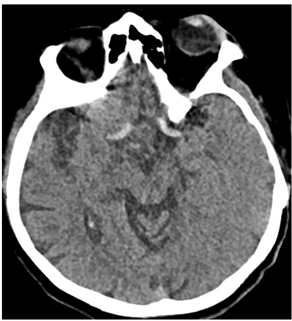
Figure 1. The CT performed at admission showing bilateral hyperdense MCAs. At first glance, it can be misinterpreted as bilateral atherosclerotic lesions.

Turkish Journal of Cerebrovascular Diseases 2021; 27(1): 50-55