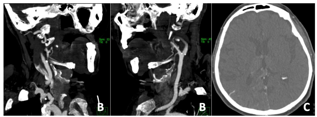
Figure 2. The CTA performed at admission. The right (A) and left (B) ICAs are occluded distally to the bifurcation level. On the axial image (C) we can see the lack of adequate collateral blood flow.