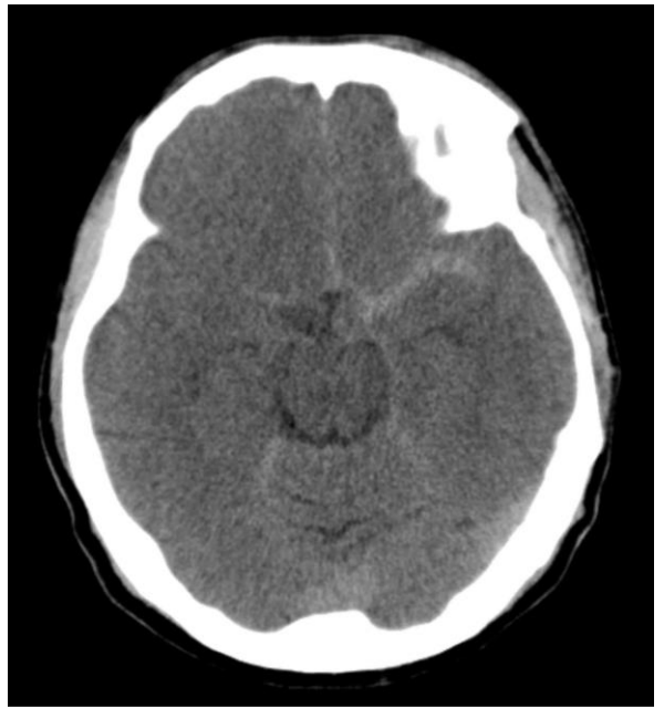
Figure II. Axial unenhanced computed tomography. Increased density secondary to the bleeding of aneurysmal dilatation localized at the left middle cerebral artery trifurcation.

prevention of post-LP headaches quoted a 33% incidence of post-LP headaches (22). Another drawback of LP is the diagnostic uncertainty created by the high rate of local trauma from the spinal needle, which can introduce peripheral blood into the cerebrospinal fluid (CSF) sample (ie, a traumatic tap). Rates of traumatic tap have been reported at 10% in a recent study of 1489 bedside procedures in an academic teaching hospital (23).