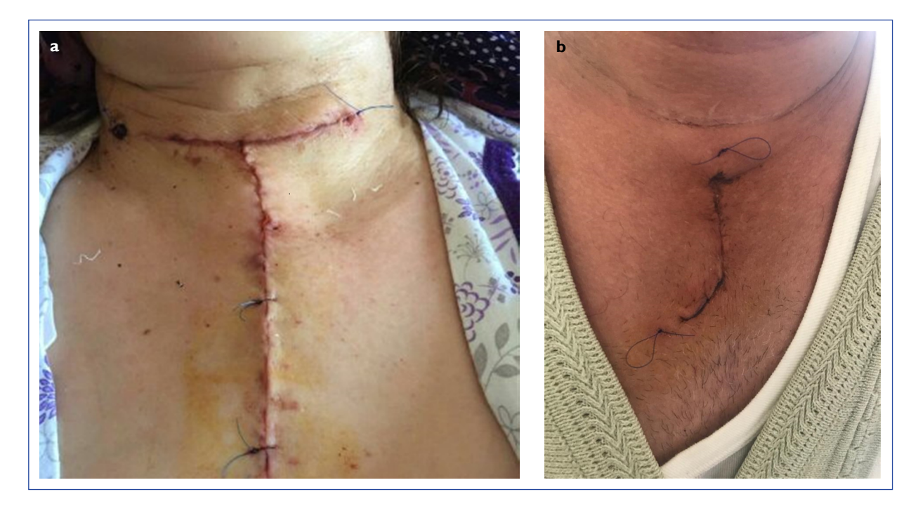
Figure 2. "T" incision in which cervical incision and sternotomy are combined (a) and vertical incision extending from the sternal notch to the third intercostal space (b).

the superior border (Fig. 2a) or a separate 5 cm vertical upper mini-J incision (Fig. 2b) extending from the sternal notch to the third intercostal space without reaching to the internal mammary vessels. Intraoperative neuromonitorization for recurrent laryngeal nerves was performed in all thyroid cases. Operative success, exposure provided by split sternotomy, and complication rates were examined.