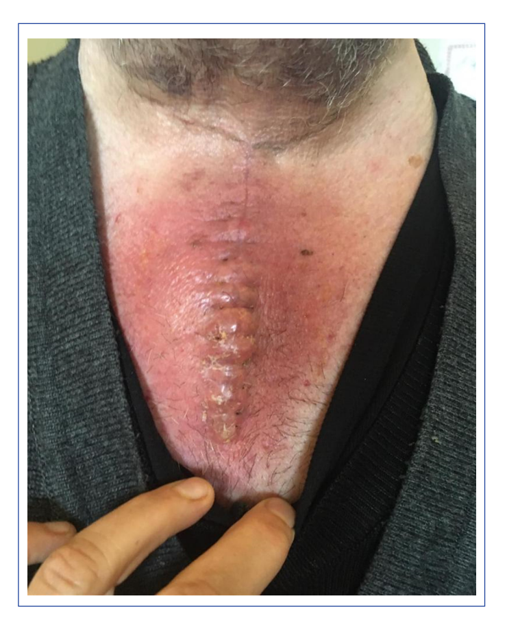
Figure 5. Patient with hyperemia and cellulitis in the incision.

indication for surgery was multinodular goiter (MNG) in 3(25%) patients, recurrent MNG in 3(25%) patients, primary hyperparathyroidism (HPT) in 2(16.7%) patients, secondary HPT in 1(8.3%), and thyroid cancer in 3(25%) patients. (Figures 3 and 4). While one of the thyroid cancer cases was anaplastic thyroid cancer, papillary cancer was diagnosed in the others. Seven patients (58.3%) had signs of compression causing dyspnea. The procedure is the first intervention in 6(50%) of the patients and 6(50%) patients had a history of previous cervical intervention. The mean operation time was calculated as 227.7±36.3 min (163-285). It was possible to reach all pathological thyroid and parathyroid tissues through the split sternotomy incision, to perform their dissection, to clearly reveal the recurrent laryngeal nerves and major vascular structures (innominate vein, aortic aorta, etc.) and their relationship with the thyroid gland. No intraoperative uncontrolled bleeding was encountered. Hospital stay was calculated as an average of 5±3.2 days (2-14). Post-operative hypocalcemia in 6(50%) patients and unilateral vocal cord paralysis in 1(8.3%) patient developed, and all complications resolved spontaneously within an average of 3 weeks. In 1(8.3%) patient, hyperemia and cellulitis occurred on the incision, and they recovered with antibiotherapy and drainage (Fig. 5).