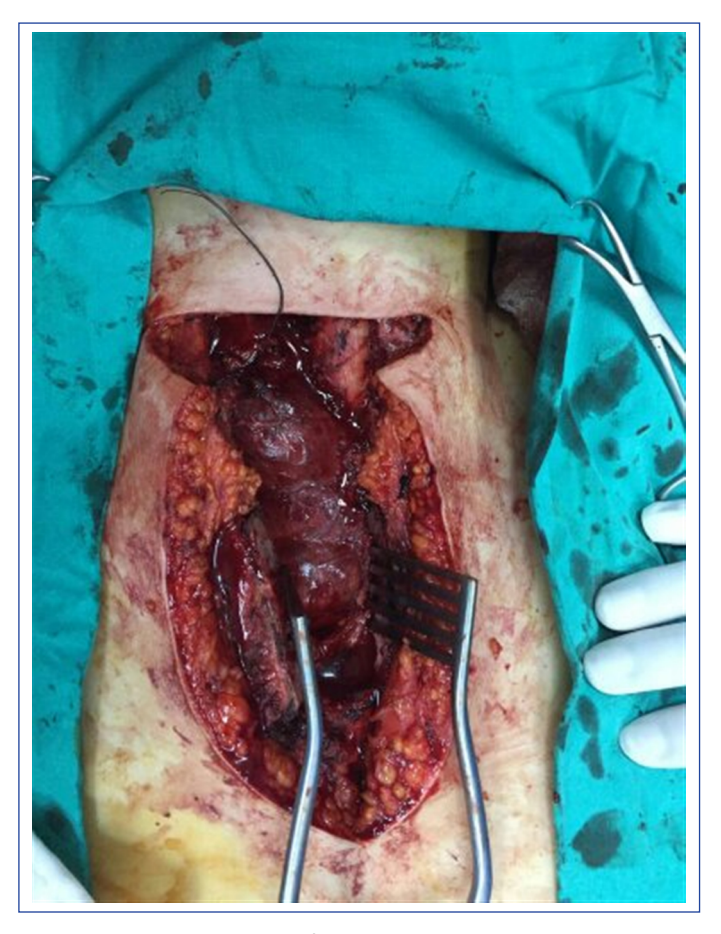
Figure 3. Surgical view of a retrosternal goiter patient who underwent split sternotomy.

Twelve (12/246=4.9%) patients who underwent split sternotomy due to retrosternal thyroid pathology or mediastinal ectopic parathyroid adenoma were included in the study. One patient who underwent total sternotomy was excluded from the study. The mean age of the patients was calculated as 57.25\pm12.62 (44–83) years. Eight (66.7%) patients were female and four (33.3%) were male. The