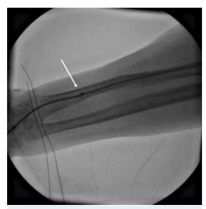
Figure-2: Catheter knot seen just at the tip of the sheath (white arrow)