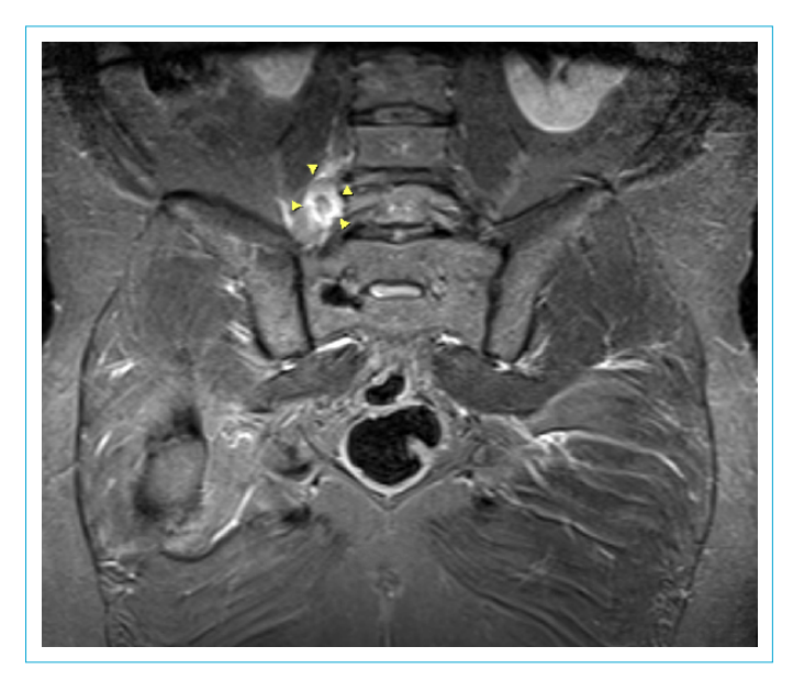
Figure 1. lv-contrast pelvis MRT1 sequence.

In the requested lumbar and pelvic MRI of the patient, the contrast enhancement pattern and edematous appearance in the perineural areas extending from the right neural foramen level to the psoas muscle level at the L4-L5 disc level and foraminal level were observed which was found to be compatible with neuritis (Figs. 1, 2). Then patient Electromyography (EMG) and MR Neurography.were requested from the patient, In EMG, "Intense denervation potentials were observed in the right M.vastus lateralis and M. rectus femoris muscles at rest, while the voluntary muscle and the right M.vastus lateralis, M. rectus femoris and M. Iliopsoas muscles have varying degrees of high amplitude, longlasting, polyphasic MUPs, and rarefactions were observed.