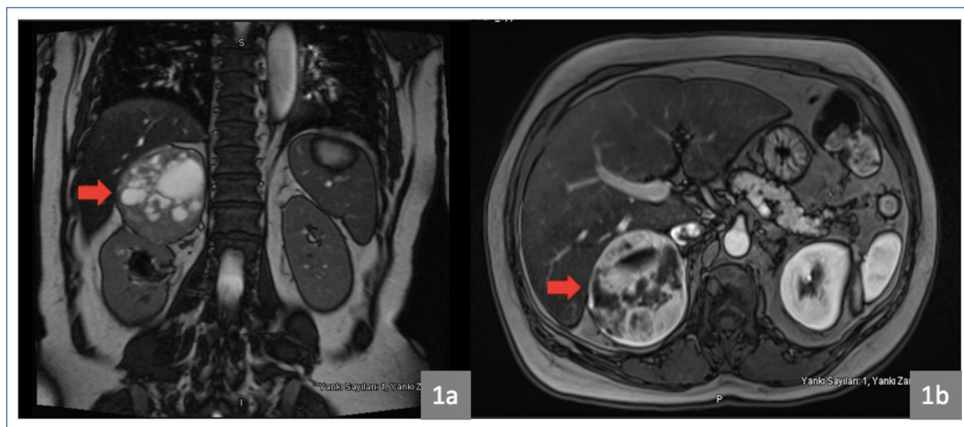
Figure 1. A serious contrast enhancement is observed in the solid areas of the well-circumscribed lesion measuring approximately 75 × 75 × 71 mm, in a heterogeneous structure containing fluid and solid areas suggesting pheochromocytoma. (a) Tumor extension to liver and kidney in T2 coronal series on magnetic resonance imaging. (b) Appearance of the tumor in T1 transverse series.

In primary hyperaldosteronism, where surgical resection is curative in unilateral disease, the tumor size is usually