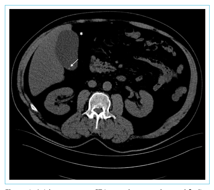
Figure 1. Axial non-contrast CT image shows no abnormal finding related to iron accumulation in kidneys. Note hydropic gallbladder (star) and millimetric gallstone (arrow).

On MRI images, there was no evidence of acute biliary pathologies but the bilateral signal of the renal cortex was markedly and diffusely low on T2-weighted images comparing to the signal of medulla consistent with hemosiderin accumulation. On in-phase sequence, prominent signal loss in renal cortex was also noted comparing to out-of-phase images. In the light of these MRI findings and clinical history, we recommended further investigation for PNH disease. The flow cytometry analysis of peripheral blood showed deficiency of glycosylphosphatidylinositol-anchored proteins (GPI-APs). The bone marrow biopsy revealed only reticulocytosis. These findings were consistent with classical PNH. The patient has been followed with eculizumab therapy since then.