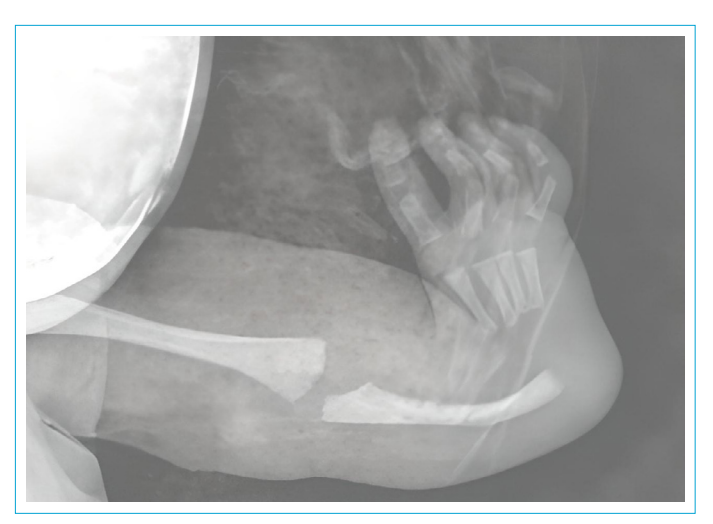
Figure 3. X-ray of the patient shows the aplasia of left radius and thumb.