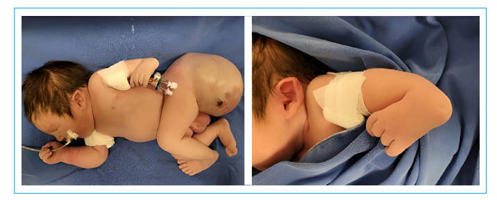
Figure 1. Approximately 15 \times 10 cm protruding a mass covering the sacrococcygeal region of the patient and left upper limb defect with the absence of left thumb.

Lumbar, coccygeal, and sacral MRI of the patient showed a big mass formation (diameter 10 \times 7 \times 5 cm) in the sacrococcygeal region, consistent with type 2 sacrococcygeal teratoma, with cystic and solid components that fill the entire pelvis and extend into the lower abdomen, and have the same fat intensity in solid components (Fig. 2). Left radius and thumb were not seen in the X-ray of the patient (Fig. 3). When we evaluated the patient in terms of anomalies accompanying sacrococcygeal teratoma, while cranial ultrasonography was normal, echocardiography was revealed ostium secondary atrial septal defect