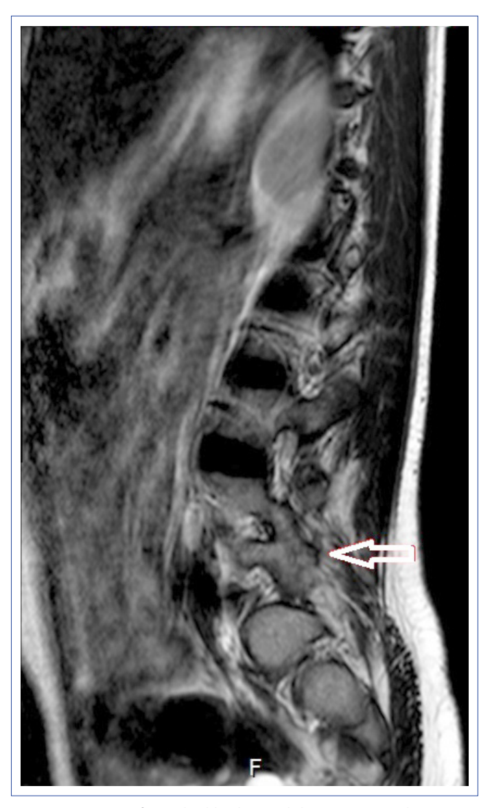
Figure 2. Fusion of vertebral bodies and their posterior elements at L4 and L5 vertebral levels.

tion was unremarkable, and the patient was found to have pes cavus deformity. Magnetic resonance imaging (MRI) of the lumbar spine revealed the following: spinal cord terminated at the level of L3 vertebral inferior endplate (tethered cord) (Fig. 1); fusion of vertebral bodies; lateral posterior elements at L4-L5 level (Fig. 2); and syringohydromyelic cavitations at the distal spinal cord (Fig. 3). EMG findings consistent with anterior horn involvement at L5-S1-S2 levels on the left side, which also affected the posterior root of the spinal ganglion, were detected. Urodynamic, MRI, and somatosensory evoked potential (SEP) examinations did not reveal any pathology. The patient was referred to the neurosurgery department for consultation, and surgery was scheduled after making a diagnosis of tethered cord syndrome.