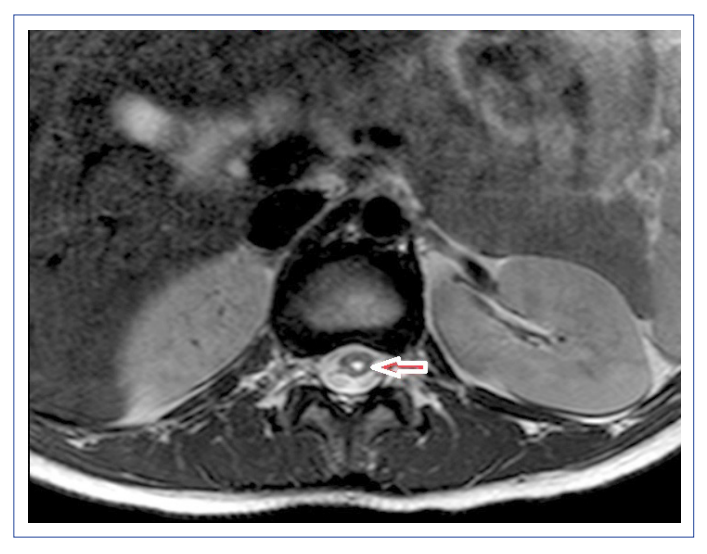
Figure 3. A longitudinally oriented syrinx cavity is seen (arrow).