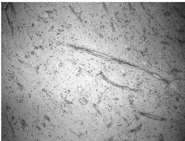
Figure-2: x10 Hemangioperistoma-like vascular proliferation