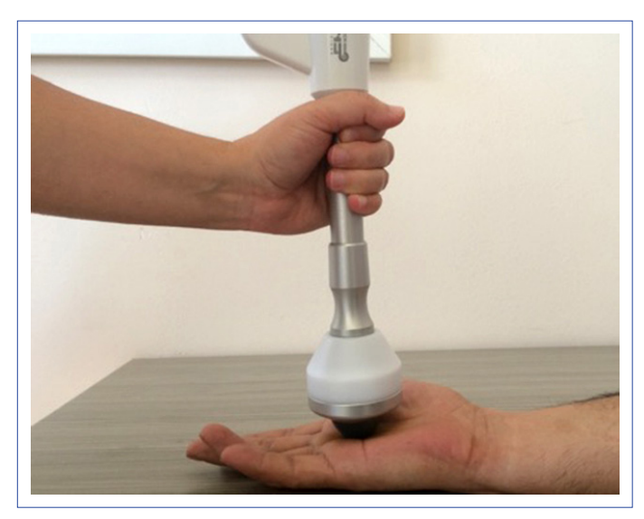
Figure 1. Extracorporeal shock wave therapy (ESWT) application.

There was a significant improvement in the second mea-