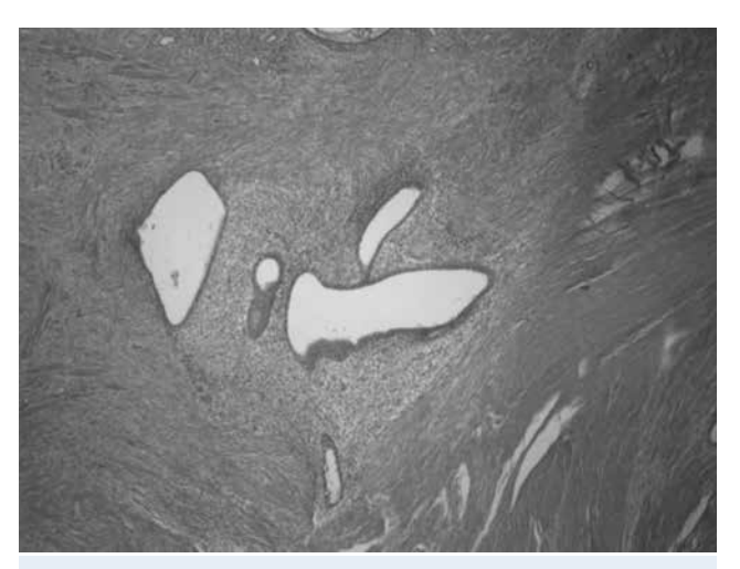
Figure-3: Endometriosis focus with endometrial glands in the muscle fibers and endometrial stromal tissue in the surrounding.

histopathological examination was suggested. The mass was totally excised under general anesthesia with a clean surgical margin of 1 cm and the specimen was sent to pathological examination (Figure-1). The defect was restored primarily.