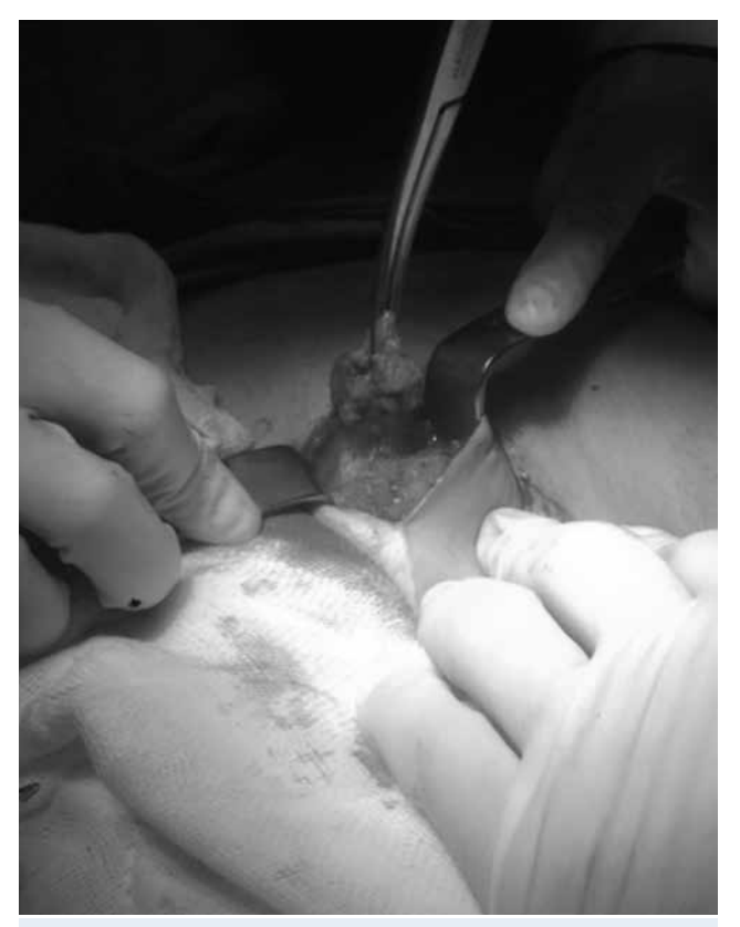
Figure-1: The mass was totally excised under general anesthesia with a clear surgical margin of 1 cm and sent for pathologic examination.

Thirty-seven-year-old, with an obstetric history of gravida 3, para 1, abortus 2 was admitted with painful swelling in the right upper quadrant of the old Caesarean scar for about 1 year, which was growing gradually. Patient expressed that pain increased especially during menstruation periods. The anamnesis of the patient revealed that the patient had a Cesarean operation 5 years ago, and had no pelvic endometriosis history or other disease. On physical examination; a hard painful subcutaneous mass of approximately 3x3 cm in size, palpated on the upper right side of the Caesarean incision scar was detected. The uterus and ovaries were normal in the gynecological examination. Other system examinations were normal. Ultrasonographic superficial evaluation of the anterior wall of abdomen revealed a 29x29 mm heterogeneous, vascularized solid lesion with irregular borders. The patient's laboratory tests were normal. Pelvic magnetic resonance imaging (MRI) imaging was requested. The MRI revealed a lesion of about 1.5x2 cm in the right anterior wall of the pelvis with contrast enhancement, including the transverse fascia, and