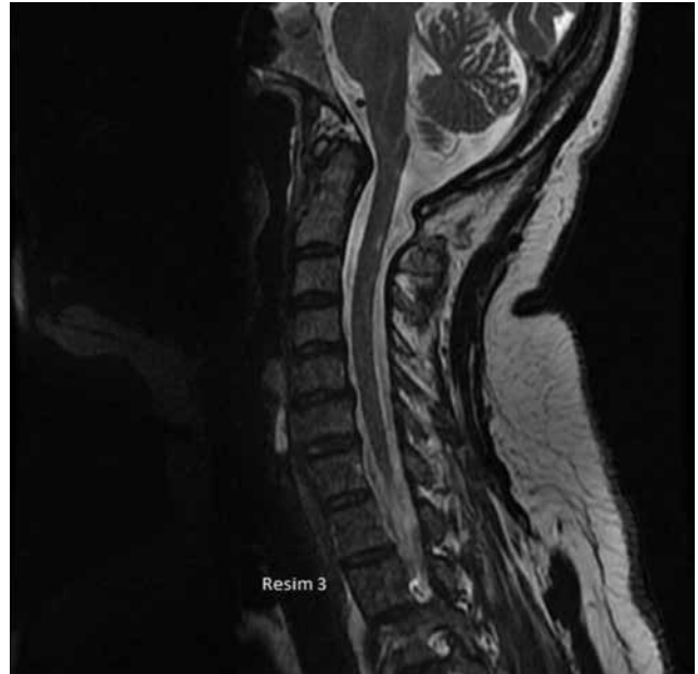
Figure-3: Almost full recovery in the repeated cervical MRI 3 months later