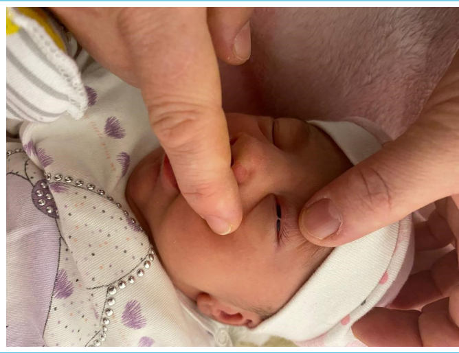
Figure 1. Left eye localized ankyloblepharon filiforme.