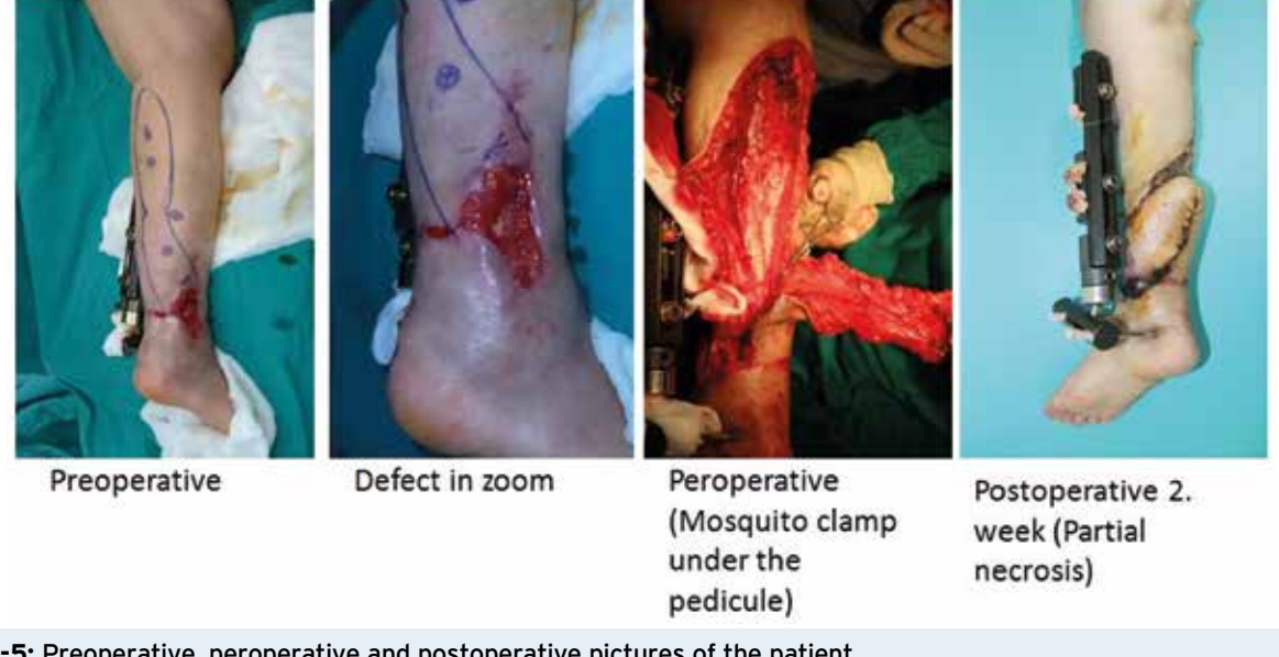
Figure-5: Preoperative, peroperative and postoperative pictures of the patient

Figure-4: Preoperative, peroperative and postoperative pictures of the patient