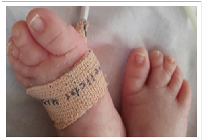
Figure 2. Bilateral syndactyly of 2–3 toes.