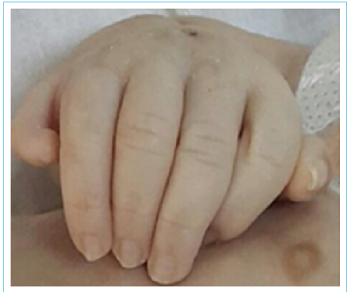
Figure 1. Six fingers in the right hand.