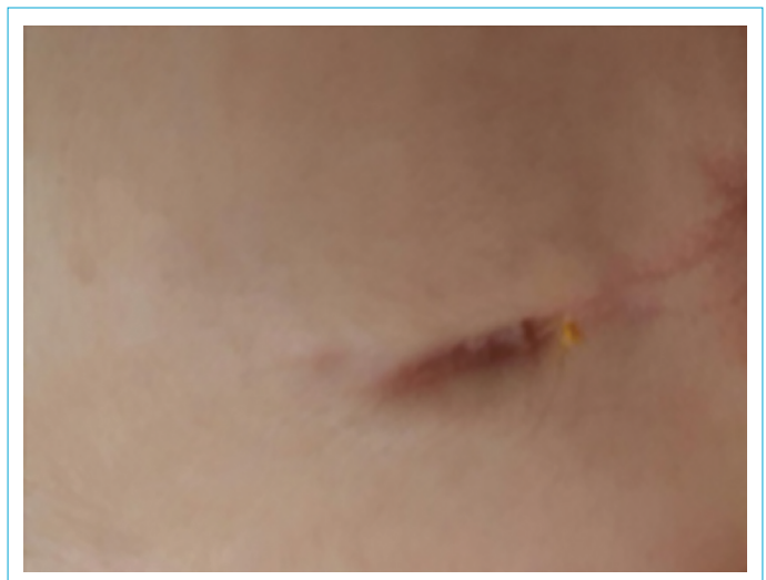
Figure 3. Sacral dimple.