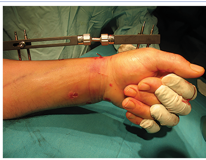
Figure 1. Postoperative evaluation of optimal reduction and distraction.

In the etiological evaluation, fractures occurred due to falling on the floor at home (n=5, 20%), on flat ground outside the home (n=9, 36%), and from height (n=6, 24%); traffic accidents (n=4, 16%); and direct trauma (n=1, 4%) (Table 1). Five (19.23%) patients had open fractures. According to the Gustilo–Anderson classification, fractures were classi-