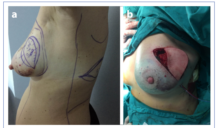
Figure 3. Preoperative and (a) perioperative photographs of a patient with left partial breast reconstruction with LD flap without implant. (b)