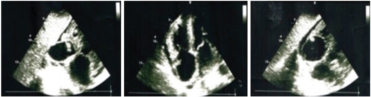
Figure 1. Transthoracic echocardiographic examination shows stage-3 diastolic function and pericardial fluid.

Localized amyloidosis is very rare, and is usually seen as secondary to systemic diseases. [2] There are reports in the literature of cases of MM with amyloidosis and systemic disease. [3,4] Here, we present a 44-year-old male with MM who had a diagnosis of macroglossia and edema.