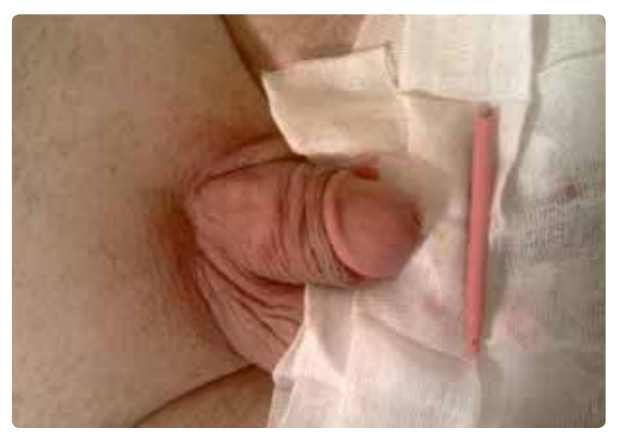
Figure 1. A ballpoint pen extracted from urethra.

Urethral foreign body is an emergency case that can