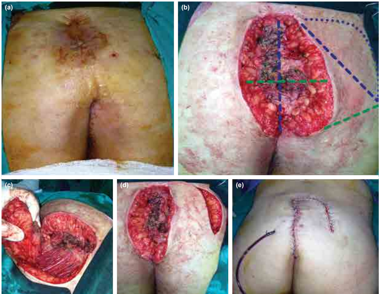
Figure 2. (a) Recurrent sacrococcygeal pilonidal disease. (b) Width (green dashed line) was measured for flap's base, height (blue dashed line) was measured to form a triangle with the lateral side of the defect and then adapted concave to defect (blue dots). (c) Preparation of the flap with gluteal muscle fascia. (d) Prepared flap (e) Closure of the defect.