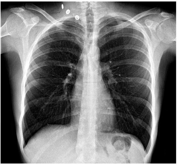
Figure 3. Chest radiography image taken prior to discharge.

taneous pneumomediastinum or secondary pneumomediastinum. The frequency varies between 1/7000 and 1/12000.<sup>[2]</sup> Secondary pneumomediastinum may have a traumatic or non-traumatic cause. While blunt trauma is a frequent mechanism, many conditions and triggers, including esophageal perforations, bronchial asthma, diabetic ketoacidosis, vomiting, forceful straining during exercise or coughing, inhalation of drugs, as well as other activities associated with the Valsalva maneuver can be a source of non-traumatic pneumomediastinum.<sup>[1,2]</sup> Alveolar rupture caused by a pressure gradient between the alveoli and the lung interstitium was first described by Macklin.<sup>[1,4]</sup> In the present case, an apparently healthy, 18-year-old male presented with subcutaneous emphysema, chest pain, and shortness of breath in the absence of any trauma history.