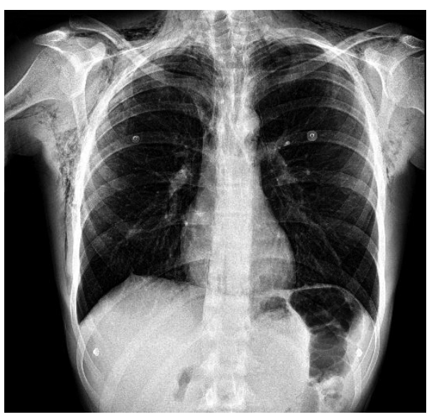
Figure 1. Chest radiography image taken upon admission to the emergency department