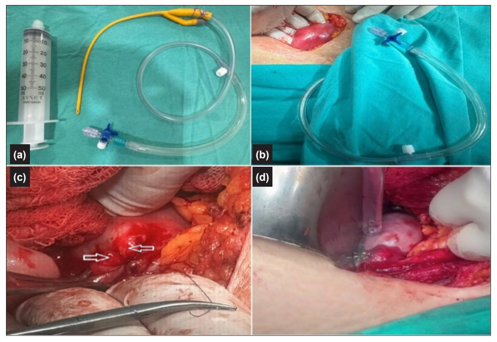
Figure 2. Preparation of the saline pertubation kit and steps of the procedure. (a) The components of the saline pertubation kit. (b) Placement of the kit near the surgical area. (c) Distal and proximal tubal ends after approximation by a continuous suture of the separated mesosalpinges. (d) Confirmation of patency of the fallopian tubes by saline with air bubbles flowing from the fimbriae.

assessment of the bilateral relationships between the ovaries, the fallopian tubes and uterus were examined. The proximal and distal ligated ends of the tubes were identified, transected and the lumens were exposed and prepared for anastomosis. Proximal patency was confirmed