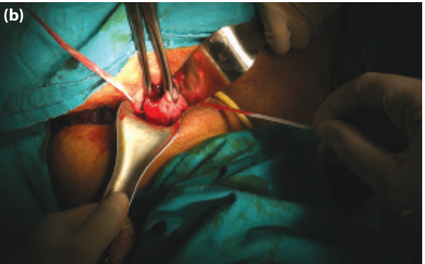
Figure 1. (a) High cervical ligation suture, (b) McDonald cerclage.