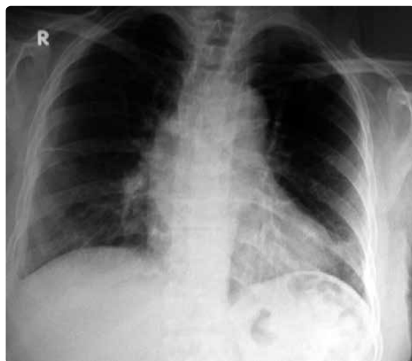
Figure 3. Posteroanterior chest X-ray.

In accordance with the recommendation of the rheumatologist, methylprednisolone treatment at daily dose of 20 mg was initiated. At follow-up visit, decreased sedimentation rate and CRP level were detected. On pulmonary radiograms, pleural effusion was observed to have regressed and parenchymal nodules had disappeared (Figure 3).