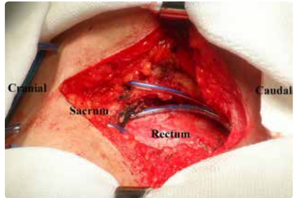
Figure 2. Operative site. Colored images can be seen in online issue of the journal ( www.keahdergi.com ).

tion performed with the patient in lithotomy position. Deeper digital rectal examination detected mass measuring nearly 4 cm with smooth mucosal outer layer, proximal part of which could be partially felt. Sigmoidoscopy yielded view of ulcerated scar tissue of pre-existing, solitary rectal ulcer on posterior wall of the rectum; biopsy specimens were obtained. Mucosal layer of other parts of the sigmoid colon retained natural color and appearance. Histopathological examination of biopsy material did not reveal any evidence of malignancy. Surgery was performed under general anesthesia with the patient in jackknife position through posterior approach. Coccygectomy and excision of retrorectal tumor were performed (Kraske procedure) (Figure 2). Postoperative follow-up period was uneventful, and the patient was discharged on postoperative second day. At follow-up visit performed on postoperative day 7, surgical site was not problematic, and the patient had no complaint related to defecation or urination. Pre-existing pain radiating to left leg had resolved. Histopathology report of the mass indicated dermoid cyst. Informed consent was taken from the patient.