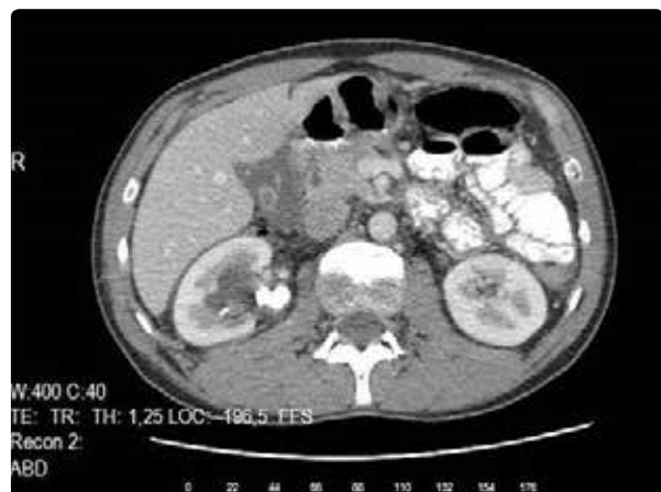
Figure 1. Dilated right renal pelvis and paraduodenal fluid on abdominal CT.

Bile content of intra-abdominal free fluid identified by radiological investigations was collected with 12-French percutaneous drainage catheter with the help of US for differential diagnosis of urinoma or hemorrhagic fluid. A total of 200 cc of bile material not containing any particles was extracted. During 4-hour follow-up of the patient, another 700 cc of bilious fluid was drained. On examination, clinical picture was assessed as compatible with biliary peritonitis. Patient